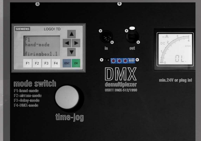
mode switch by a Siemens-control for DMX, AirRam, delay-mode and direct