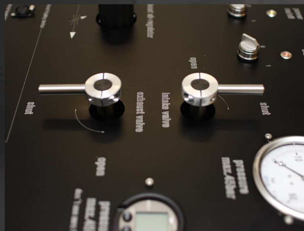
intake and exhaust valves